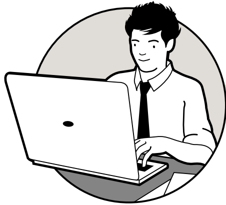
1 A User logs on