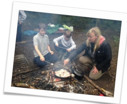
Once students have mastered lighting a fire, we start to cook.