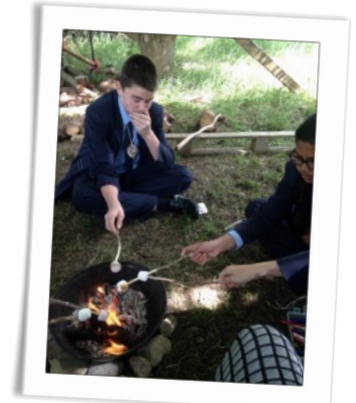
I encourage students to socialise whilst they are eating toasted marshmallows.