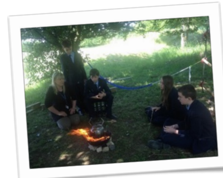
For enrichment we meet on the school field. This gives the students a chance to chill out and talk to others that they might not have spoken to.