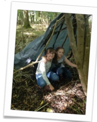
I help nurture friendships and bonds that can last a lifetime.