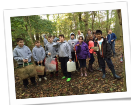
It is important for the students to take ownership and respect of the camp.