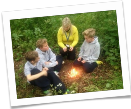
At Forest School I help students learn new skills , by modelling.