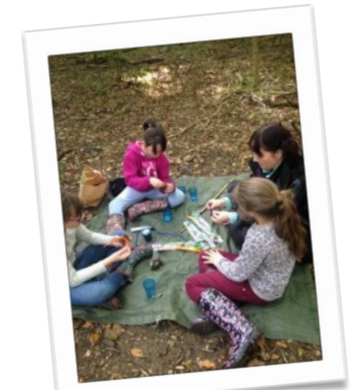
I introduce crafts that they can produce for themselves.