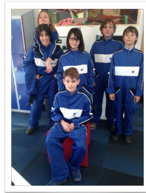
I introduced the next phase of Forest School, the Forest Rangers.