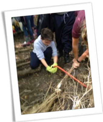
It's great to watch a student achieve something that they may have struggled with before, showing resilience .