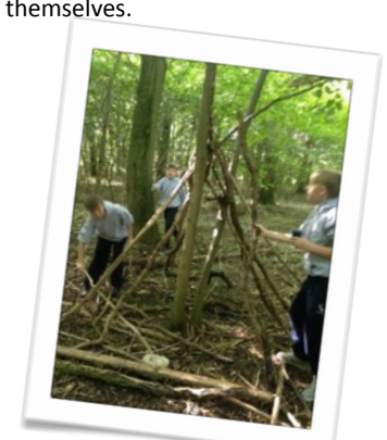
I facilitate team building and praise positive attitudes.